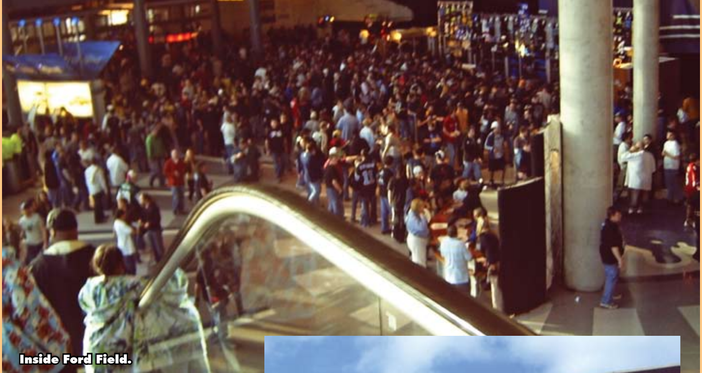
Inside Ford Field.

I hope to be one of the best ringside announcers, like Jim Ross (JR), who was inducted in the WWE Wrestling Hall of Fame in 2007.